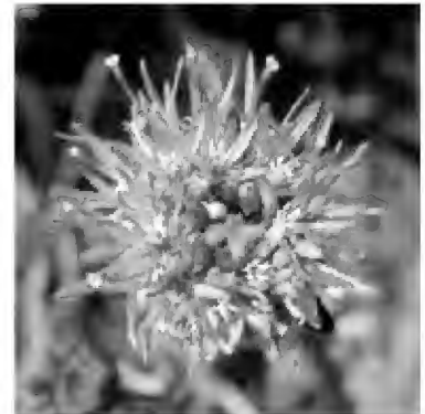
Figure 13. Sheep's-bit ( Jasione montana ).

Next on the agenda was a foray along Hubbard Creek, east of Red Creek Road at Flanders, Southampton Township. Species new to me at this site were saltmarsh fleabane (in bud), mock bishop's weed (in bloom), yellow thistle (leaves), scarlet oak, sweet woodreed, possumhaw (var. nudum ; in green fruit; S1 in New York and at the northern limit of its range), and a dragonfly, eastern pondhawk (a female). Possumhaw-like shrubs are very common in New Brunswick, but they are all wild raisin (var. cassinoides ). I was happy to get better acquainted with a few more species that I don't see very often, e.g., Atlantic white cedar (not occurring in eastern North America north of Maine), Canadian burnet (in New Brunswick limited to the northern part of the province and a few sites along the Bay of Fundy), germander (in bloom), water pimpernel (in bloom; known from one estuarine river in New Brunswick), sundrops (in peak bloom) and maleberry (only recently discovered in Canada in Nova Scotia).